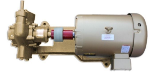
Industrial Oil Transfer Pump - 25GPM -3 Phase