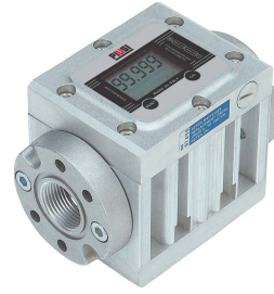
39 GPM Digital Oil Flow Meter 1.5"