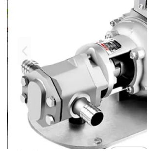
Stainless Steel 12GPM Oil Transfer Pump Head

Since 2009, we have been supplying portable and stationary pumps for moving all types of oil. Oil cleaning centrifuges are also important tools to re-use oil as fuel or lubricant.