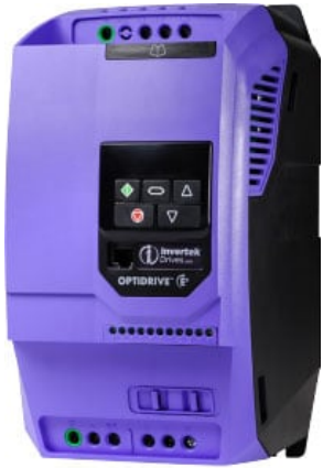
3HP VFD for 25GPM Pump Indoor