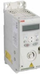
1.5HP ABB ACS 150 VFD