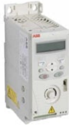
1.5HP ABB ACS 150 VFD