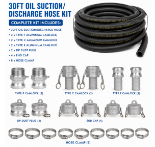
30ft Aluminum Camlock Hose Kit

Since 2009, we have been supplying portable and stationary pumps for moving all types of oil. Oil cleaning centrifuges are also important tools to re-use oil as fuel or lubricant.