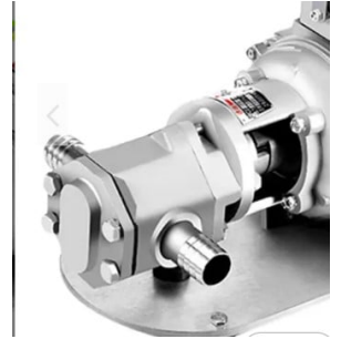
Stainless Steel 12GPM Oil Transfer Pump Head

Since 2009, we have been supplying portable and stationary pumps for moving all types of oil. Oil cleaning centrifuges are also important tools to re-use oil as fuel or lubricant.