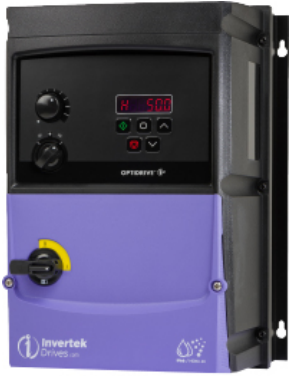
1HP VFD for 12GPM Pump - Switched Outdoor