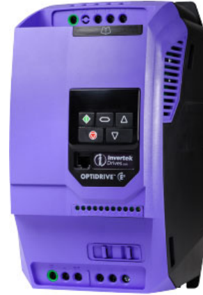
3HP VFD for 25GPM Pump Indoor