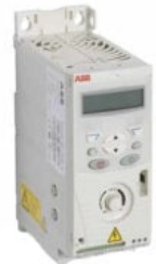
1.5HP ABB ACS 150 VFD

Since 2009, we have been supplying portable and stationary pumps for moving all types of oil. Oil cleaning