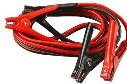
12V Cables with Alligator Clamps