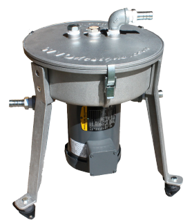
Basic Oil Centrifuge

Since 2009, we have been supplying portable and stationary pumps for moving all types of oil. Oil cleaning centrifuges are also important tools to re-use oil as fuel or lubricant.