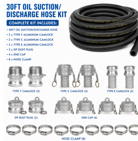
30ft Aluminum Camlock Hose Kit