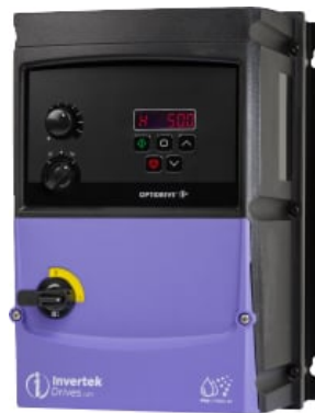
2HP VFD for Pump - Switched Outdoor