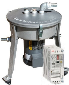
Extreme Oil Centrifuge