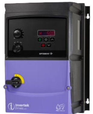
2HP VFD for Pump - Switched Outdoor

Since 2009, we have been supplying portable and stationary pumps for moving all types of oil. Oil cleaning centrifuges are also important tools to re-use oil as fuel or lubricant.