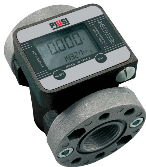
15 GPM Digital Oil Pump Flow Meter 1"