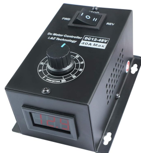
12-48v Variable Speed Controller