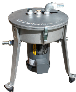
Basic Oil Centrifuge