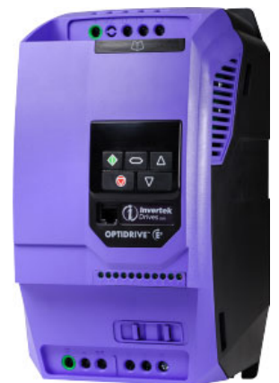
3HP VFD for 25GPM Pump Indoor

Since 2009, we have been supplying portable and stationary pumps for moving all types of oil. Oil cleaning