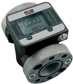
15 GPM Digital Oil Pump Flow Meter 1"