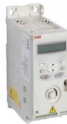
1.5HP ABB ACS 150 VFD