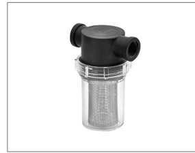
In Line Suction Strainer 1"