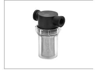
In Line Suction Strainer 1"

Since 2009, we have been supplying portable and stationary pumps for moving all types of oil. Oil cleaning centrifuges are also important tools to re-use oil as fuel or lubricant.