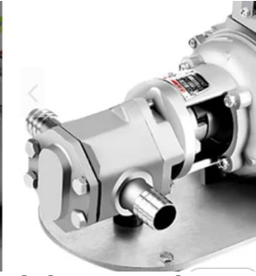
Stainless Steel 12GPM Oil Transfer Pump Head