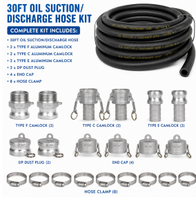
30ft Aluminum Camlock Hose Kit