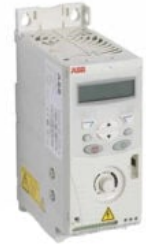
1.5HP ABB ACS 150 VFD

Since 2009, we have been supplying portable and stationary pumps for moving all types of oil. Oil cleaning centrifuges are also important tools to re-use oil as fuel or lubricant.