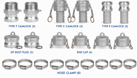
30ft Aluminum Camlock Hose Kit