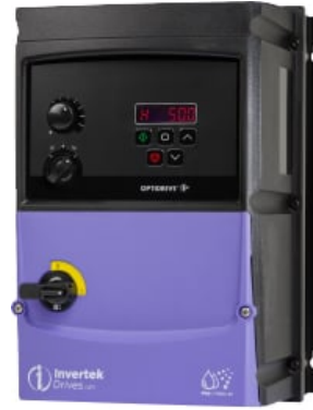
2HP VFD for Pump - Switched Outdoor