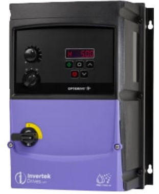
2HP VFD for Pump - Switched Outdoor

Since 2009, we have been supplying portable and stationary pumps for moving all types of oil. Oil cleaning centrifuges are also important tools to re-use oil as fuel or lubricant.