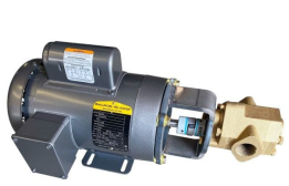
Super HD Heavy Oil Transfer Pump