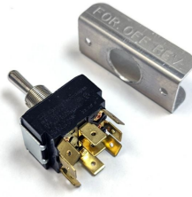
Portable Oil Transfer Pump Reversible Switch