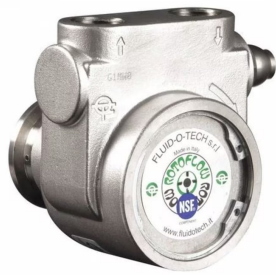
Stainless Food Grade Pump 5GPM