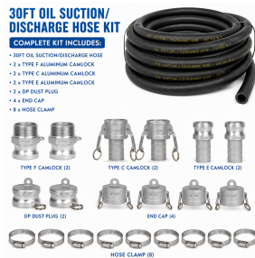
30ft Aluminum Camlock Hose Kit