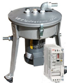
Extreme Oil Centrifuge