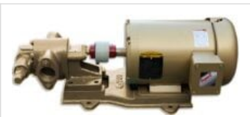
Industrial Oil Transfer Pump - 25GPM - 3 Phase