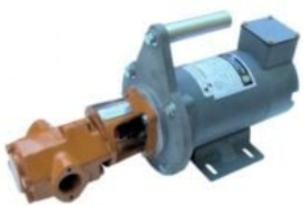
24GPM 12V Oil