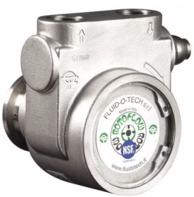
Stainless Food Grade