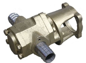
Gear Oil Pump -