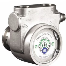
Stainless Food Grade