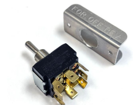
Portable Oil Transfer Pump Reversible Switch