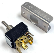
Portable Oil Transfer Pump Reversible Switch