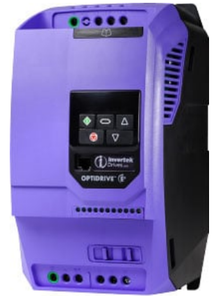
3HP VFD for 25GPM Pump Indoor

Since 2009, we have been supplying portable and stationary pumps for moving all types of oil. Oil cleaning centrifuges are also important tools to re-use oil as fuel or lubricant.