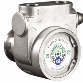
Stainless Food Grade Pump 5GPM