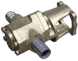
Gear Oil Pump - Pumphead Only