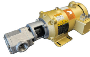
Stainless Steel 25GPM Oil Transfer Pump