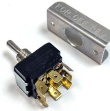
Portable Oil Transfer Pump Reversible Switch