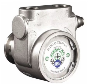
Stainless Food Grade Pump 5GPM

Since 2009, we have been supplying portable and stationary pumps for moving all types of oil. Oil cleaning centrifuges are also important tools to re-use oil as fuel or lubricant.