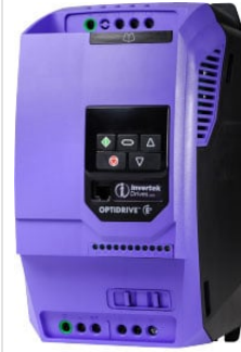
7.5HP VFD for 60GPM Pump Indoor