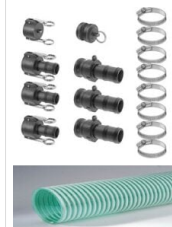
Oil Pump Hose Kit - 1.25 inch