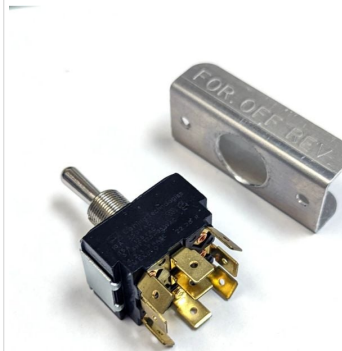
Portable Oil Transfer Pump Reversible Switch