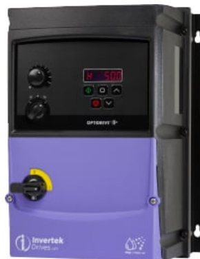
7.5HP VFD for 60GPM