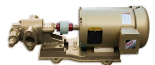
Industrial Oil Transfer Pump -