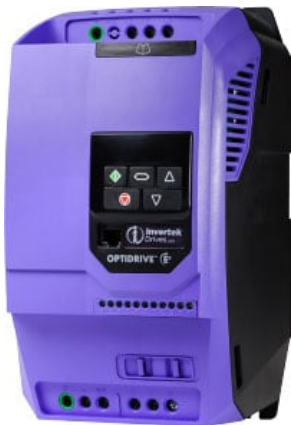
3HP VFD for 25GPM Pump Indoor