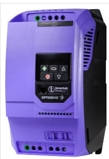
3HP VFD for 25GPM Pump Indoor